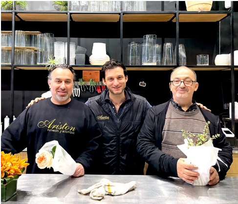
Family-owned and operated Ariston Flowers returned to the neighborhood at 78 Fifth Avenue as a dual flower shop and modern cafe concept.