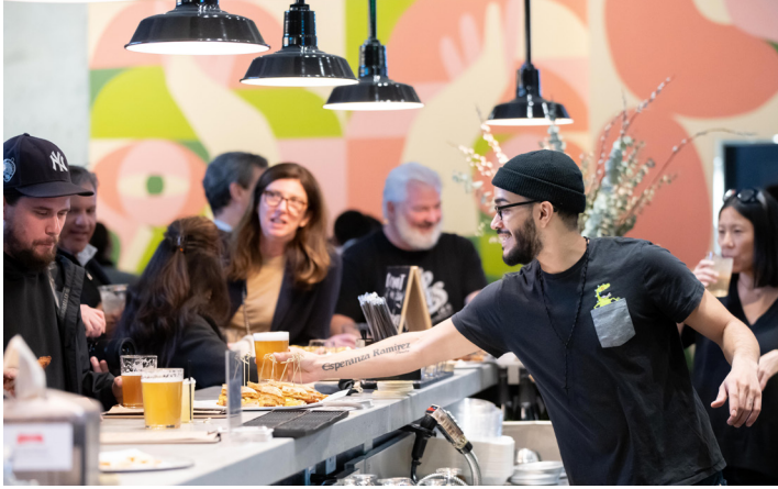
Zero Irving's 10K SF ground floor food hall, operated by Urbanspace, includes 13 vendors across a mix of cuisines, 25% of which represent first-time entrepreneurs or start-up companies. In February 2023, the food hall was featured in PureWow's "11 Union Square Restaurants Every New Yorker Should Try."

"Because we're located in the heart of the NYC tech community, Civic Hall @ Union Square's six floors of state-of-the-art training and conference center space at the new Zero Irving building will drive sustainable pathways to high-tech jobs. Civic Hall will help supply the tech workforce and spur innovation for industry leaders, the community, the City of New York, and beyond."